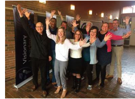
Presbyterians Sharing equips congregations for evangelism

Imagine what it would be like if each congregation in The Presbyterian Church in Canada was intentional about equipping their members to share their faith and to invite others to experience the fullness of life in Christ. Supported by gifts to Presbyterians Sharing , Canadian Ministries is spearheading a program to turn this dream into a reality. In October 2017, five congregational leaders from across the country gathered to learn more about evangelism and to begin crafting the first stages of projects to take back to their congregations. These leaders will be supported through one-on-one coaching as they begin their work in evangelism over the next year. This meeting between leaders is a first step towards developing a network that will support a culture of evangelism in local congregations across Canada.